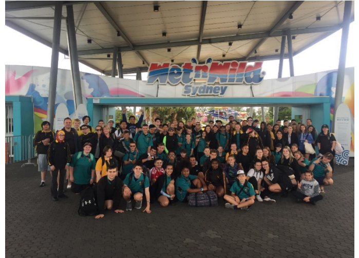
2018 excursion to Wet 'n' Wild End of Year Celebration